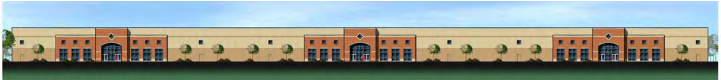
WEST ELEVATION SCALE: 1" = 20'-0"