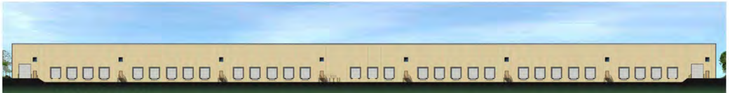
EAST ELEVATION SCALE: 1" = 20'-0"