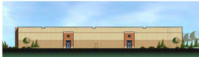
NORTH ELEVATION SCALE: 1" = 20'-0"