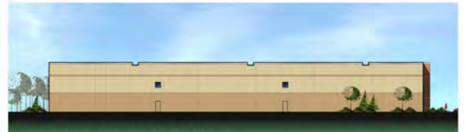
SOUTH ELEVATION SCALE: 1" = 20'-0"